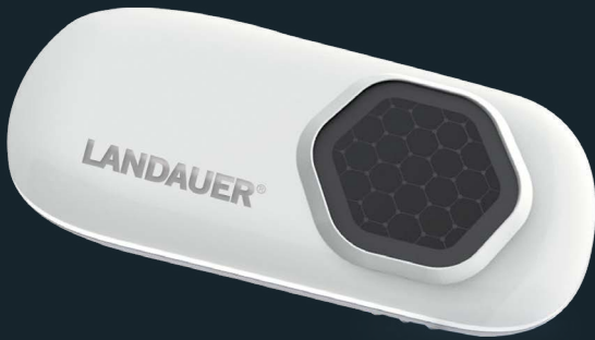
Verifii™ Digital Dosimeter